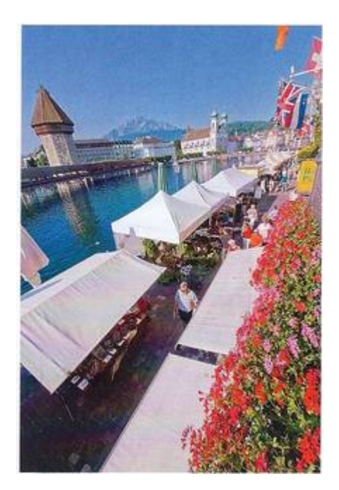
Luzern und sein Markt. Lucerne and his market.

ue the centuries-old family tradition. "I'd be happy if one of my children wanted to do that, but if not, that's fine by me too." In any case, despite the many long standing market sellers on the Lucerne weekly market, we can't tell what the future may bring. But nobody is actually worrying, as Lucerne without its market is unimaginable. Or as Charly Kolly puts it: "The weekly market belongs to Lucerne just as much as the carnival."