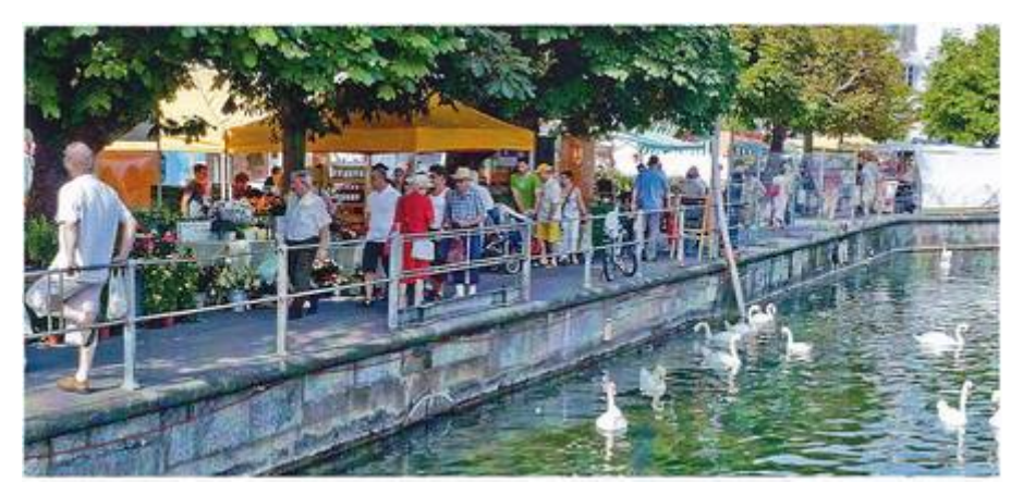
Der schonste Wochenmarkt Europas. The most beautiful weekly market in Europe.