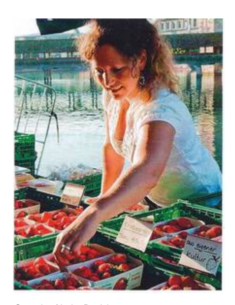
Garantiert frische Produkte Guaranteed fresh produce.